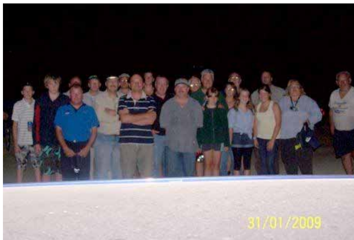
Members who attended Eel Night