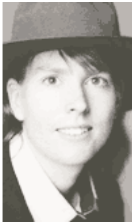
Parks Victoria Ranger

Safe swimming venues are available adjacent to the Marine Sanctuary on the river side, and there is excellent surfing and body boarding at nearby 13 th Beach.