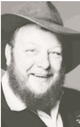
Parks Victoria Ranger

Colour distinguishes male from female fish – males being blue or green and females usually brown or red. Reaching up to a metre in length, Eastern Blue Gropers inhabit reefs to a depth of 40 metres.