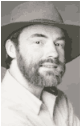
Parks Victoria Ranger

The Black and White Sea Star is not common. It appears to favour shallow rockpools on basalt and occurs only in Victoria and Tasmania.