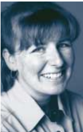
Parks Victoria Ranger

Ricketts Point also features in paintings by a number of Australia's famous early artists such as Tom Roberts and Fred McCubbin. Information on the paintings is available at sites adjacent to the sanctuary (the Tom Roberts painting The Sunny South was actually painted at Ricketts Point.